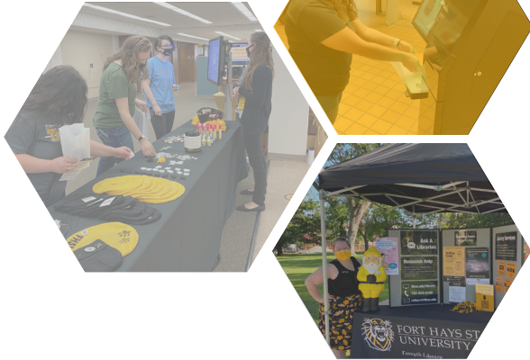
(top right) New self-checkout machine in lobby; (below) Students learning about Kit Kat Hats; (bottom right) Library table at back-to-school picnic

Since reopening the building in July 2020, the Learning Commons Desk has provided “library takeout” making books easy to request through the online catalog to be ready for pickup in the lobby. This spring, two self-checkout machines were added to the lobby to allow contactless checkouts of books and other materials.